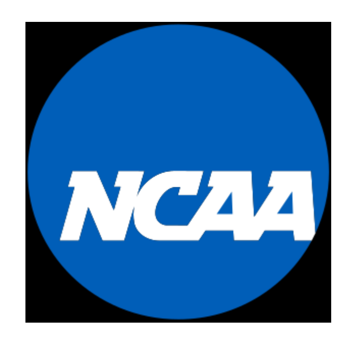
National Collegiate Athletic Association