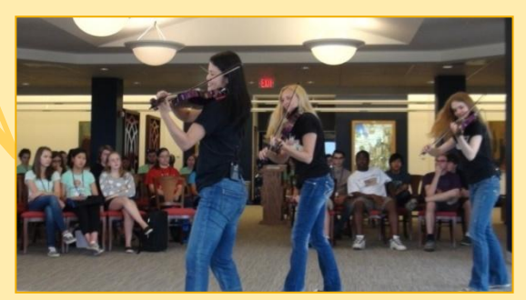
World Culture Workshop was amazing! It introduced me to a different rock/pop musical style with the three awesome violinists from The CoverGirls.